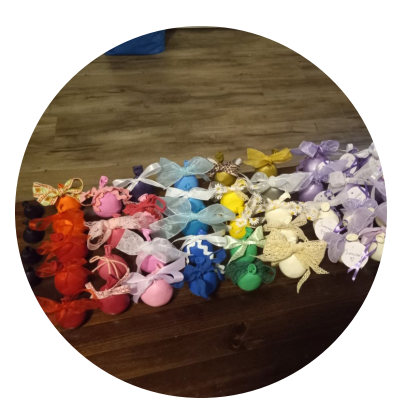
Pictured: Stress balls handmade by AHTP survivor to gift to other clients in the program.

Partnerships are an additional area where our work has grown this year; our program partnered with Sunbeam Community and Developmental Services to raise awareness and build capacity in our community regarding the high correlation between sexual exploitation and survivors living with brain-based disabilities such as Fetal Alcohol Spectrum Disorders (FASDs).