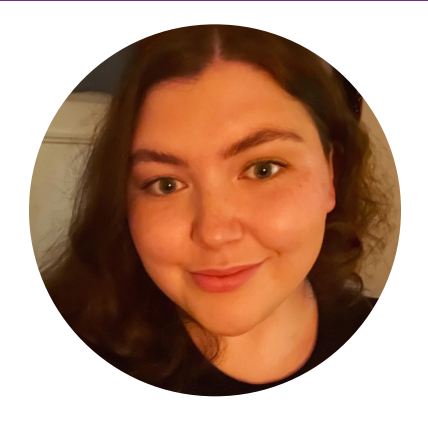
BY OLIVIA DAVITT VOLUNTEER COORDINATOR

"You are making such a difference to many people's worlds." - SASC SERVICE USER